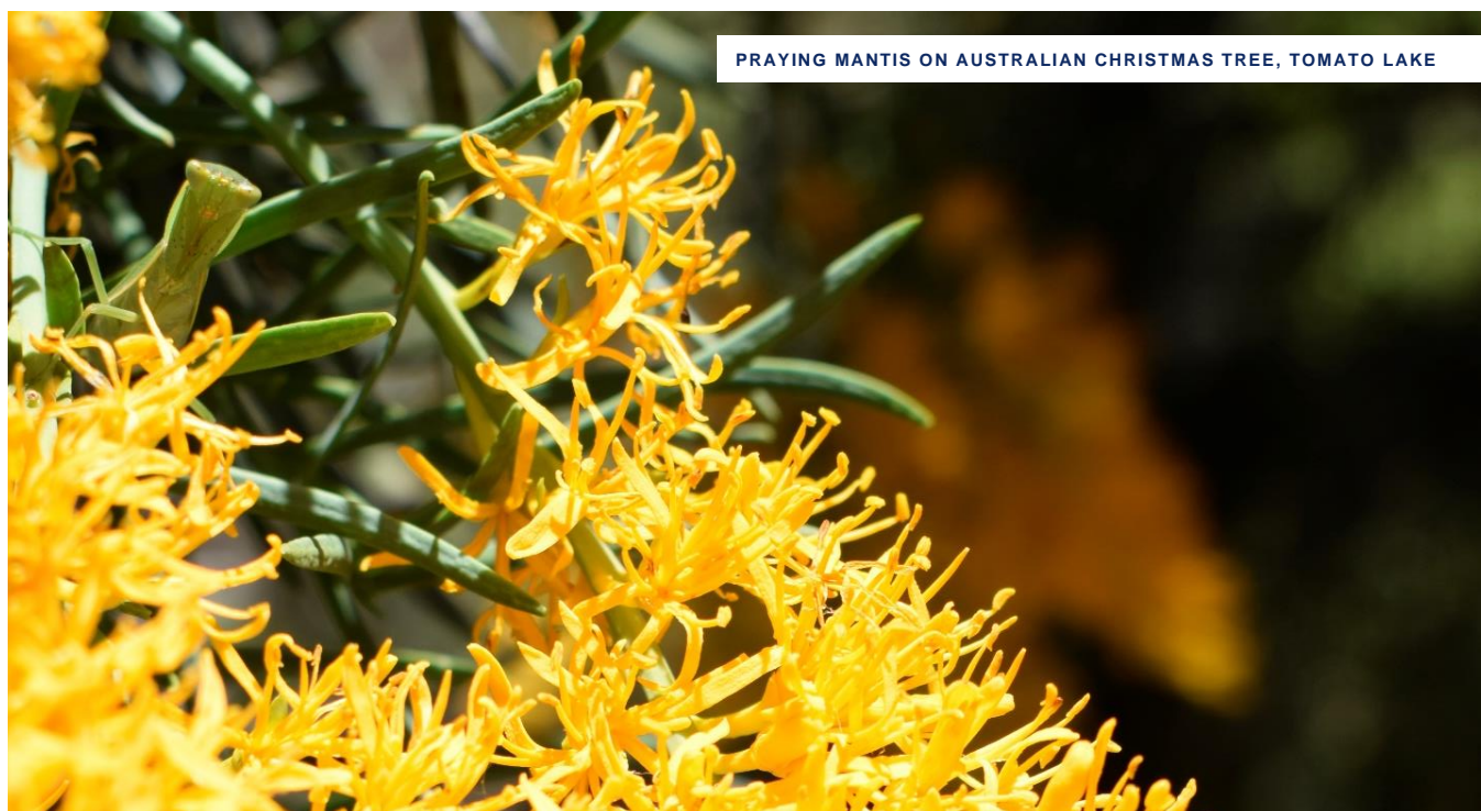
PRAYING MANTIS ON AUSTRALIAN CHRISTMAS TREE, TOMATO LAKE