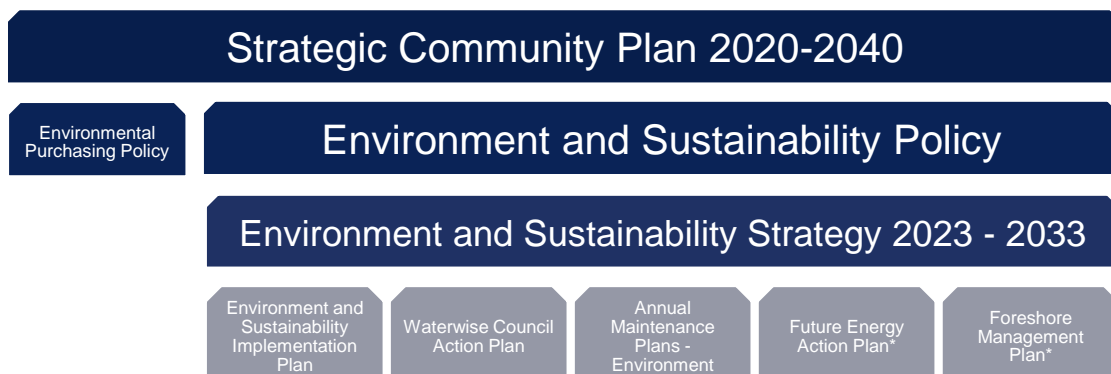
Figure 1 Components within the City's Environmental Management System. *Proposed to be developed.

Consulting Draft – Not for Public Release (V.0)