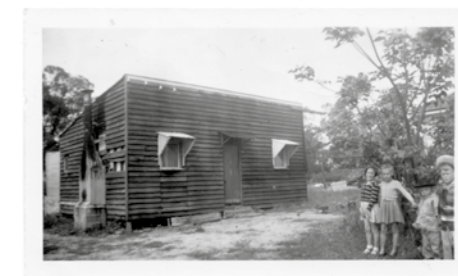
Highly Commended Lorraine Heldberg 2019 Local History Photographic Comp - The old humpy on Belgravia Street where Jones family lived while their new home was built c1957.